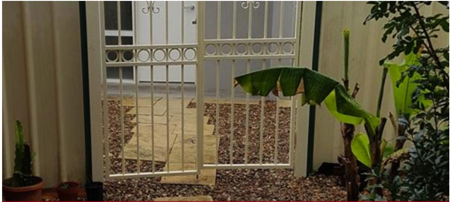
5 Selma Pl, Oakhurst